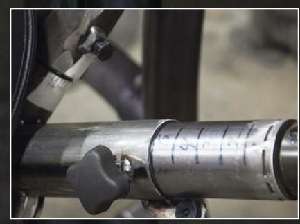
Telescoping tubing allowed for positioning of select segments of each machine for testing and design modifications.