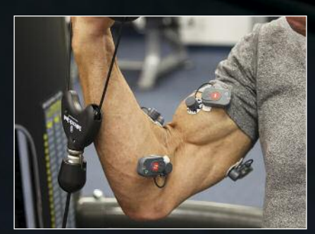
Bio-Arc design optimization testing recorded from agonist and antagonist muscle groups through surface electromyography.

EMG and goniometer testing were performed by an independent exercise research company. Four subjects (3 male and 1 female) were selected for the testing with height ranging from 5′ 1/4″ to 6′ 1″. Subject selection was limited to individuals with sufficiently low subcutaneous adipose tissue to permit accurate electromyographic measurements. EMG activity was recorded for the primary and accessory muscle(s) that target the upper and lower body musculature; furthermore, contributions from accessory and antagonistic muscle groups were also evaluated. Measurements, testing, data collection and analysis by the independent researcher group on the Bio-Arc series, provided TuffStuff engineers with the necessary design modifications to optimize muscle recruitment of primary movers specific to each machine.