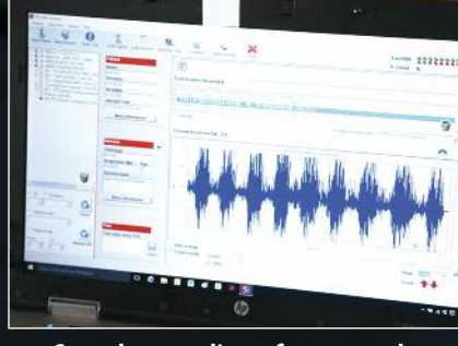
Sample recording of raw muscle activity data during EMG testing on one subject.