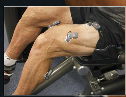
Multiple muscles undergoing EMG testing to maximize agonist muscle recruitment during Bio-Arc development.