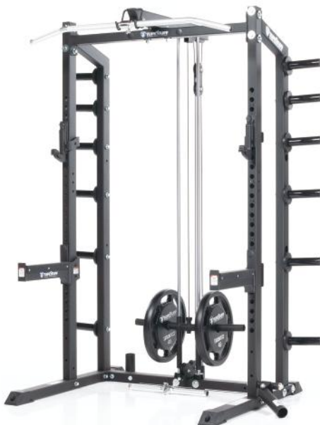
CG-8826 Hi/Low Pulley Attachment Plate Load (for Half Rack & Power Rack) Weight plates not included