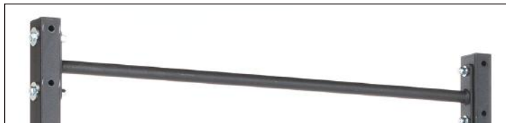
CG-8833 Pull Up Bar Connector