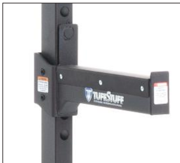
CG-8831 Safety Bar Stoppers