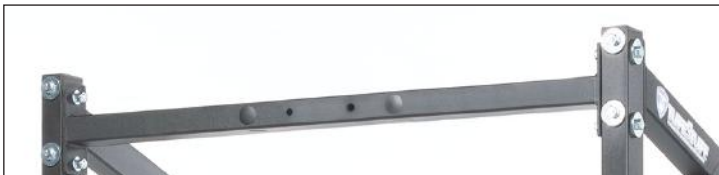
CG-8834 Connector Cross Brace