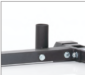
CG-8822 Olympic Bar Storage