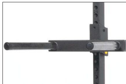
CG-8823 Dip Bar Attachment