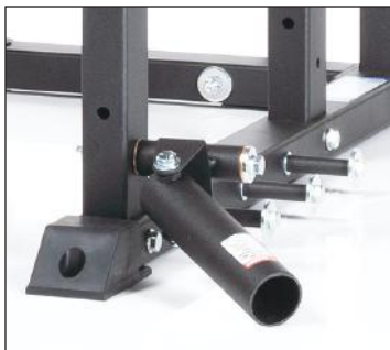
CG-8825 Landmine Attachment & CG-8824 Band Pegs