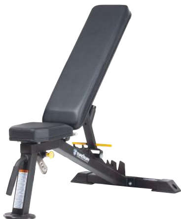
CG-8828 Flat/Incline Bench