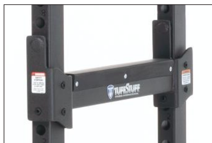
CG-8832 Safety Bar Stoppers