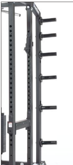
CG-8821 Olympic Plate Storage CG-8820 Bumper Plate Storage