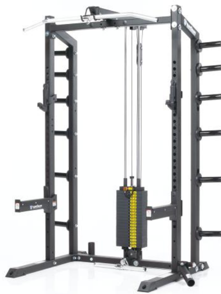
CG-8827 Hi/Low Pulley Attachment 200 lbs. weight stack (for Half Rack & Power Rack)