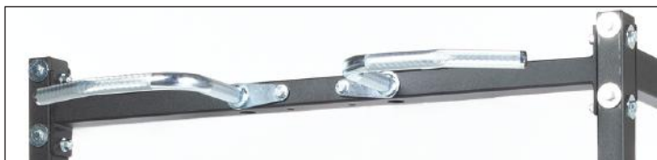
CG-8835 Multi-Grip Pull Up Handles